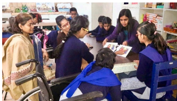
Above: testing the Disability & Sexuality toolkit with students at the Indian Institute of Cerebral Palsy (IICP) Kolkata. Below: POCSO kit, booklet version