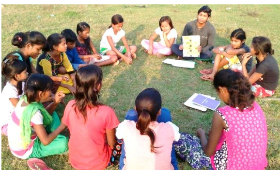
Above: ASG at YRC Youth Voice discussing how to spot warning signs amongst peers, and what to do about them. Below: ASG at the SWAPNO YRC playing the Child Rights game.