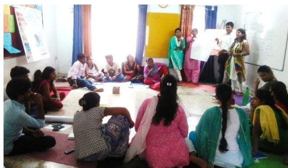
Above and Below: Training Workshops for YRC members are often designed and facilitated by more experienced members of the same groups. This is a key feature of the design of the YRC model

Over the year all 10 YRCs consolidated their work with adolescents, forming Adolescent Support Groups (ASG) in the YRC communities.