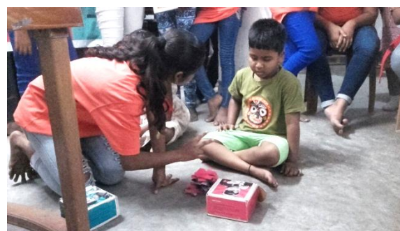
Youngest member of the audience were given gender puzzles while older kids and parents heard the presentation with rapt attention.

Credit goes to the youth mentors who guided the team of young girls, and the youth leaders who counselled and supported them for years before this event. YRC Lake Gardens Ujaan is doing something wonderful.