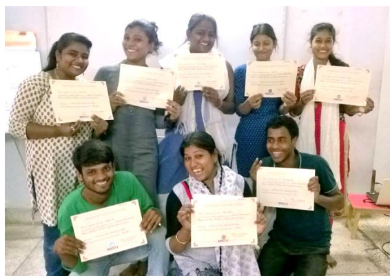
Above: Brainware graduates ready to take on training at their respective computer centres: Below: Computer centre at YRC KYP, Magrahat.