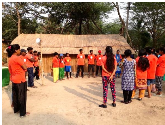
Above and Below: Training sessions at Sunderan retreats are hosted by the local Swapno YRC