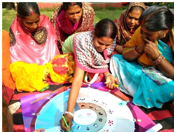
Above: Women Group Leaders playing Quality of life game, a part of the WEL Toolkit. Patna 2017. Below: Prototype of the High Value Crops tool ready for testing.

Over the year, the tool kit a series of new components to extend the capability of the WEL toolkit were created and tested with women farmers in Bihar.