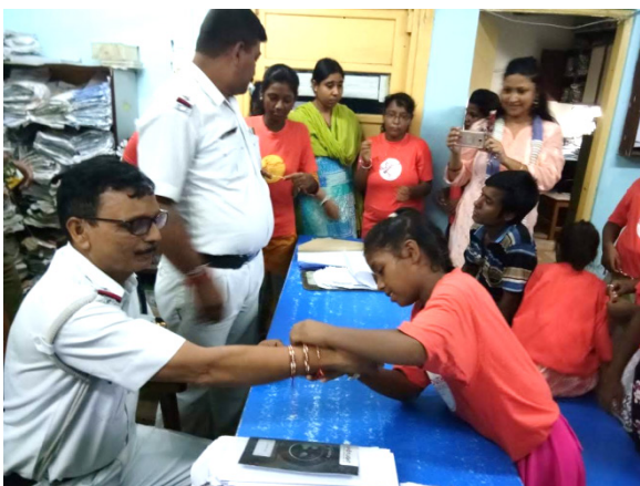
Above: members of YRC Nabadisha tie Rakhi at the local police station to show gratitude for their help in a recent POCSO case. Below: ASG members of YRC Roshni discuss life skills using a toolkit.